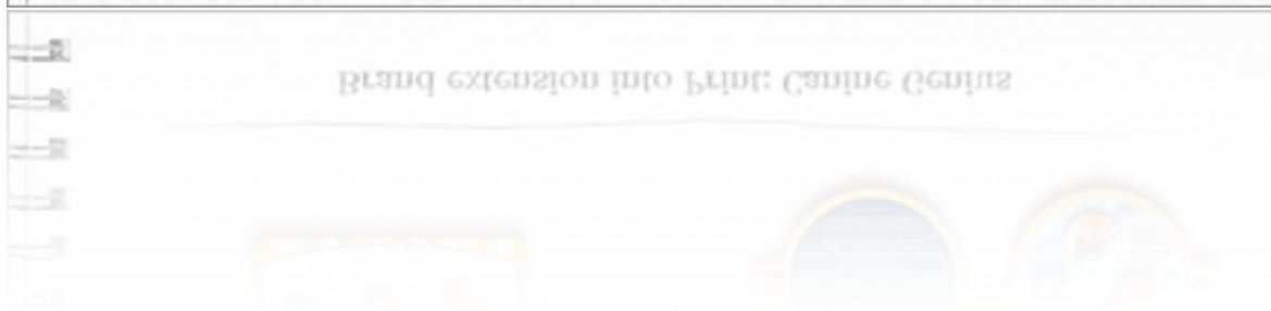
Brand extension into Print: Canine Genius