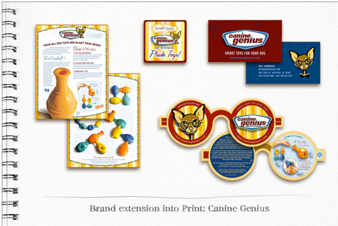
Brand extension into Print: Canine Genius